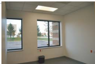
Sample Private Office