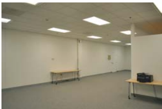
Sample Office Space