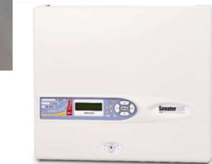
HSSD- Senator 200