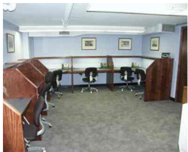
Client Recovery Suite