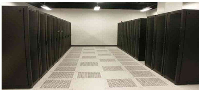
Main Data Floor