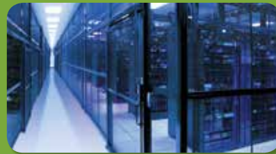
High Capacity Data Center