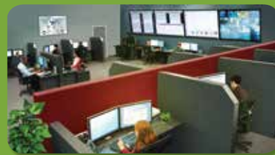
Network Operations Center (NOC)