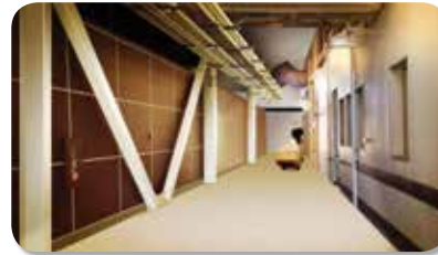
Seismic Resistant Construction