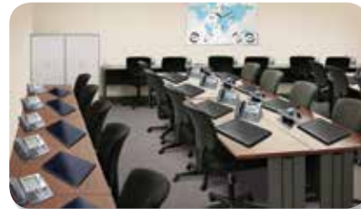
High Availability Business Center

Quest’s new Roseville facility provides an alternative to the limitations of traditional IT architectures. The virtual compute, storage systems, networks, and office space available are securely isolated and segmented.