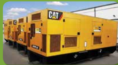
Fully Powered Redundant Backup